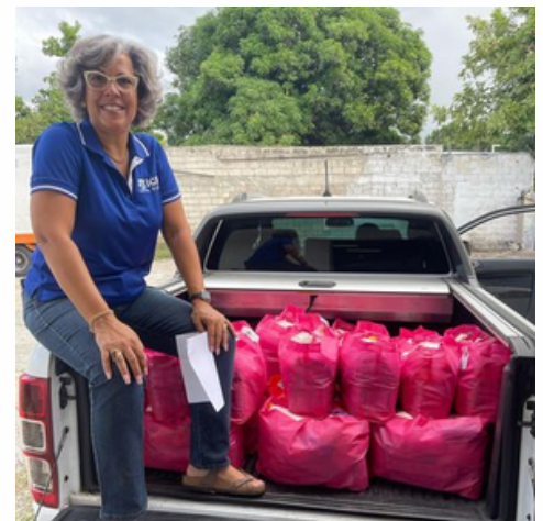
Care Package distribution at Christmas